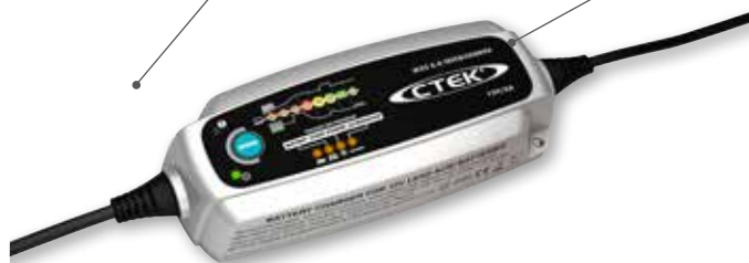
CTEK COMFORT CONNECT-clamp

Complete battery care – unique and patented system to recover, charge and maintain all lead-acid battery types to maximise performance and extend life.